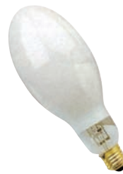
Mains Voltage Mercury Lamp