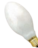
Mains Voltage Sodium Lamp